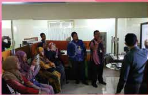
Visit From Representatives of Kolej Profesional Mara Beranang