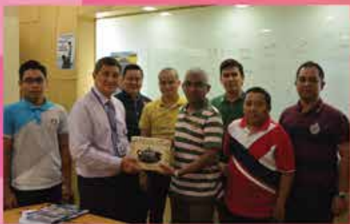
Visit From Representatives of Perbadanan Perpustakaan Awam Kedah