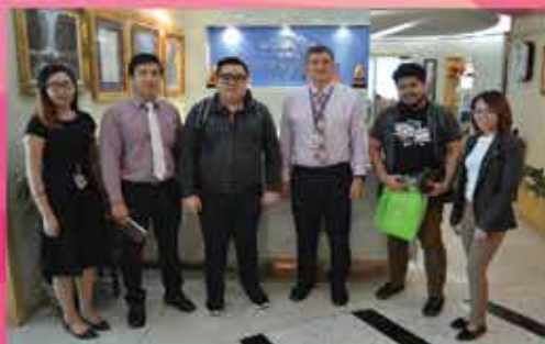
Delegates from Tabung Ekonomi Gagasan Anak Bumiputera, Sarawak (TEGAS)