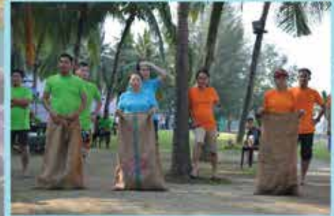
Gunny Sack Race