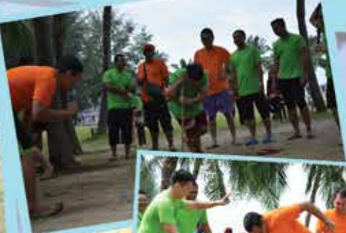
Spin & Kick