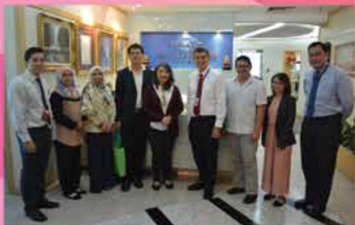
Visit From Representatives of Universiti Sains Malaysia (USM)