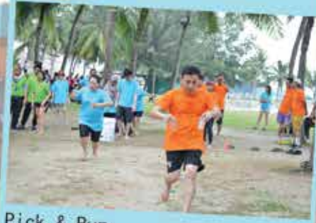
Pick & Run