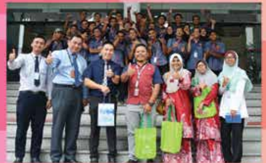
Delegates from Kolej Vokasional Lebu Cator