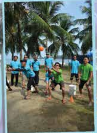
Throw & Catch