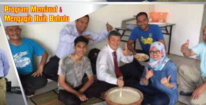
Program Membuat & Mengagih Kuih Bahulu

Thank you Dato' You will forever be in our memory