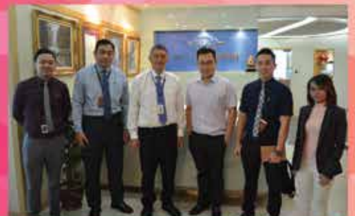
Delegates from Newline Interactive Inc (Taiwan)