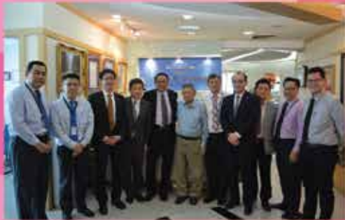
Visit From Representatives of Riso Kagaku Corporation, Japan