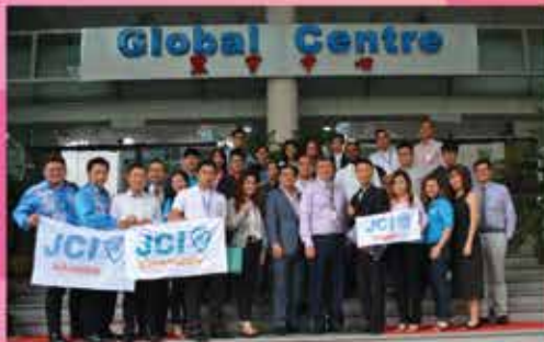
Delegates from Junior Chamber International Malaysia (JCI Malaysia)