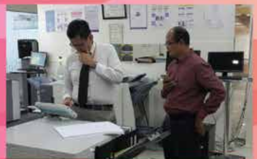
Visit from EASY PRINT CO., LTD CAMBODIA