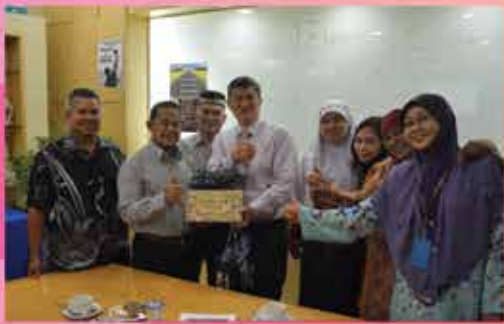
Delegates from Universiti Putra Malaysia (UPM)