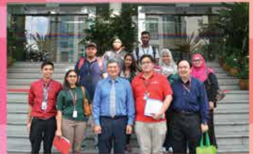
Delegates from City University, Malaysia