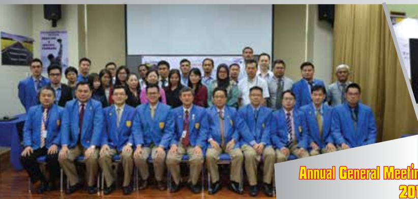
Annual General Meeting 2017