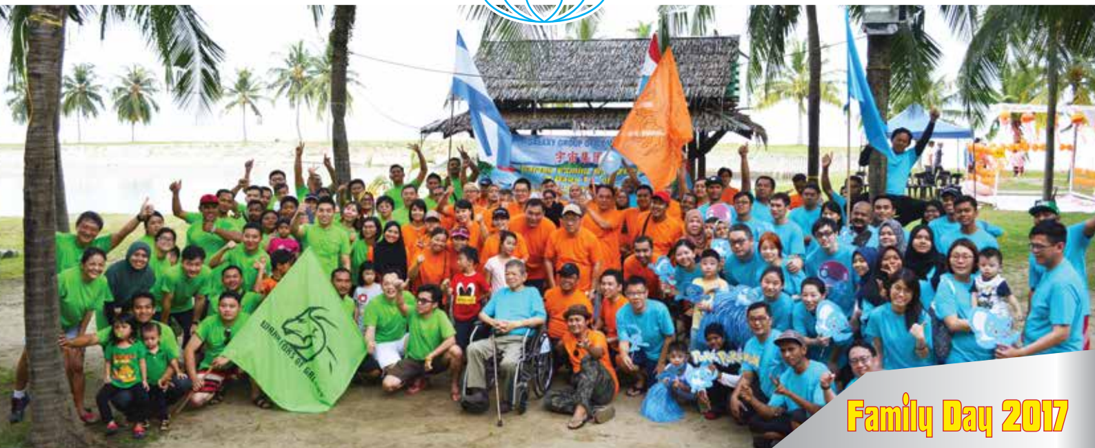
Family Day 2017